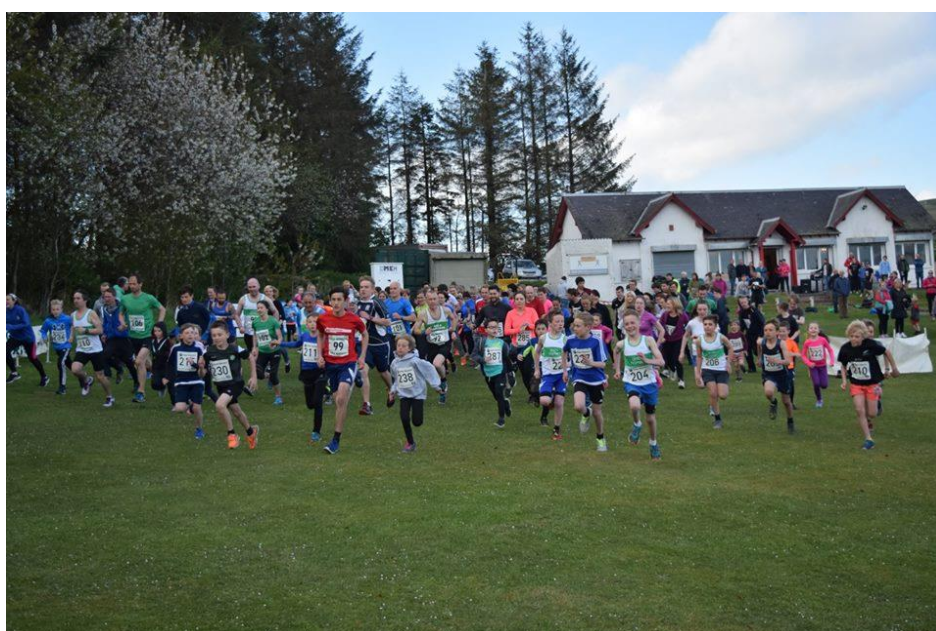
The 2016 Meikle Run gets off to a fine start

Thirty-two grants aggregating £12,700 were distributed.