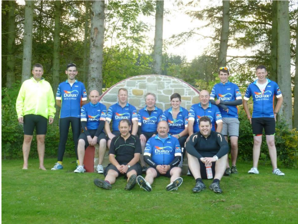
The RBMT Cycle Team took to the roads once again this year.

During the year 32 grants were awarded amounting to £11,100 to applicants participating in athletics, badminton, cricket, floorball, football, hockey, judo, mountain biking, swimming, tennis and trampolining. The recipients came from eleven towns and settlements from across the Scottish Borders.